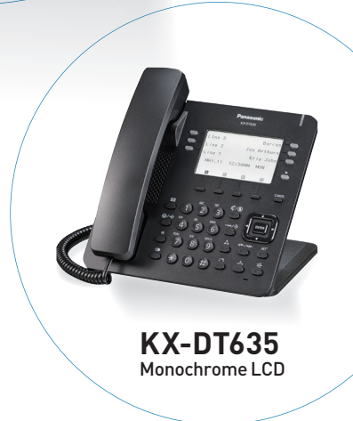
KX-DT635 Monochrome LCD

An image file can be imported to the LCD. This information is always visible to ensure user understanding during use.