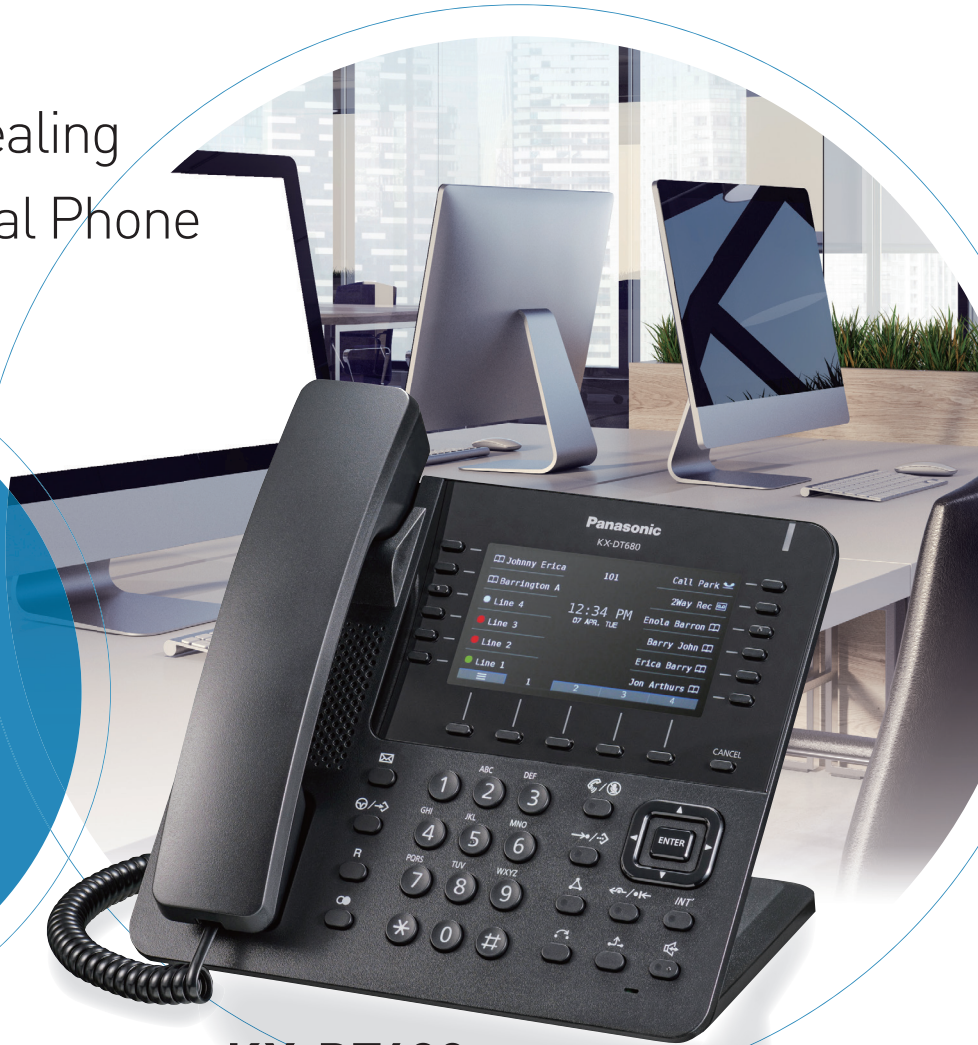
KX-DT680 Colour LCD

A digital phone that incorporates a large LCD screen with a slim design. Flexible function keys with a self-labelling feature offer the most customisation and flexibility for our customers. The large LCD screen also helps to ensure correct operation and improves usability.